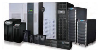
Delta offers a full range of UPS solutions from 600 VA to 4000 kVA to fulfill your power security needs.

HPH-B: UPS integrated battery model has batteries inside