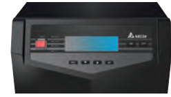
Control and LCD Display Panel