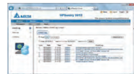
Advanced UPS Management Software - UPSentry 2012